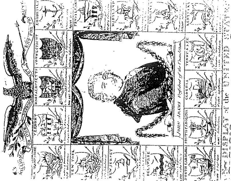
This engraving of President Adams shows the seals of all 16 states. What does "Millions for our Defense, not a cent for tribute" mean? (Hint: look up the XYZ Affair in an encyclopedia.)

Perhaps Adams was just too independent to be a good politician. Perhaps he had grown lazy by the time he became president. The old John